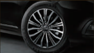
17" Aluminum Alloy Wheels