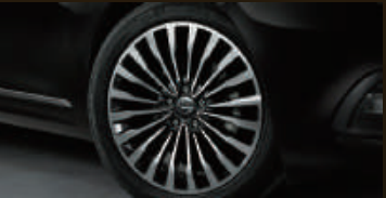
18" Aluminum Alloy Wheels