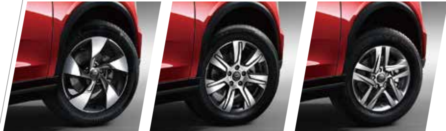
19" Aluminum Alloy Wheels